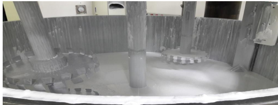
Cream plant with Anchor and cowl 2500 Ltr working capacity with scrapers