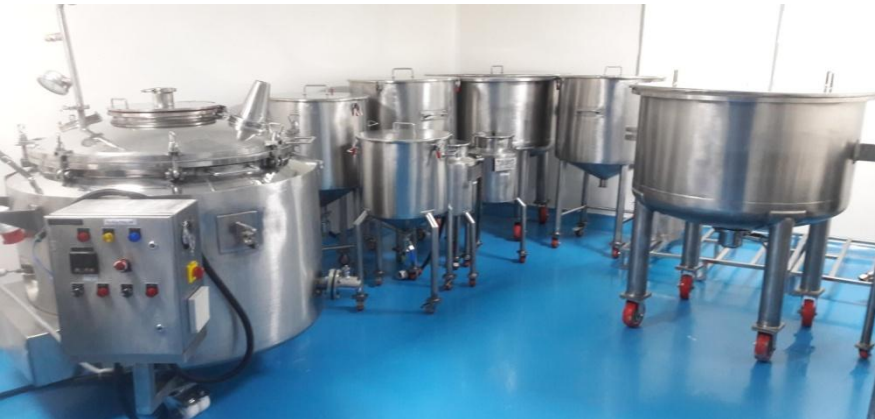
Holding vessels and storage vessels for products