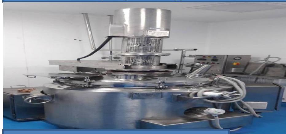
Gelatine colour mixing station with stirrer