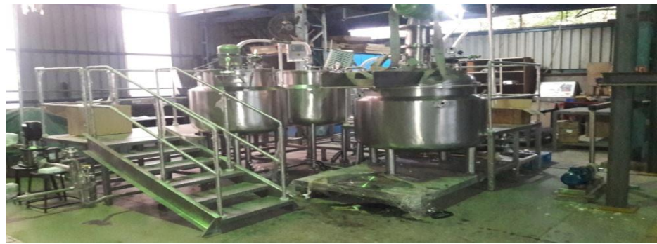
Ointment Plant 800 Litre