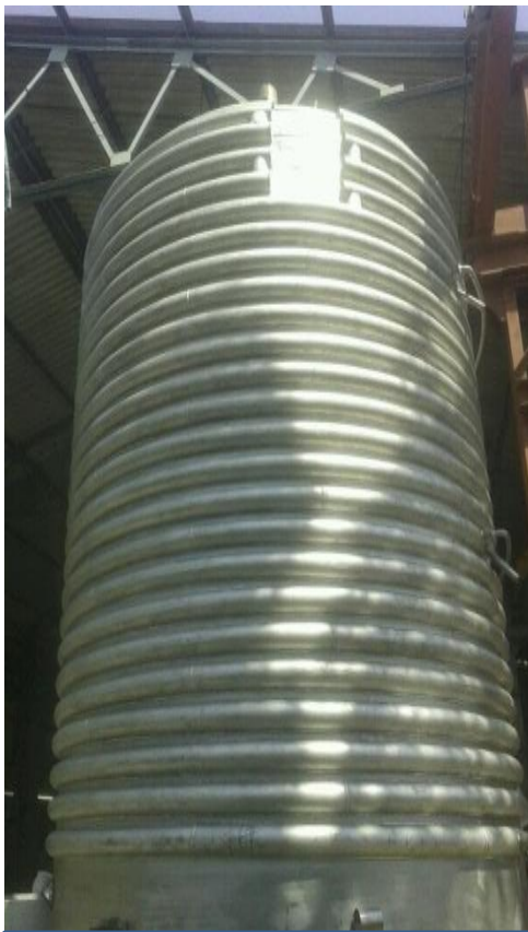
Limpet vessel 15 KL