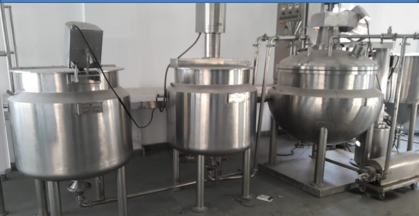
Gel kettle with side pots 500 Ltr capacity