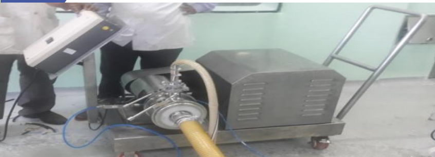
Complete design supply production, installation & commissioning of the quad slot homogenizer with trials