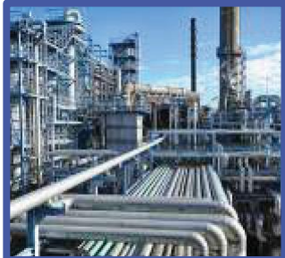
Oil & gas Industries