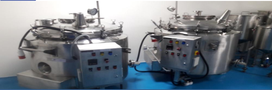
Gelatine holding vessels set up for colour mixing