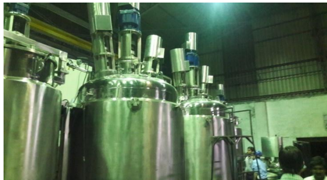
Liquid line 5 KL set up