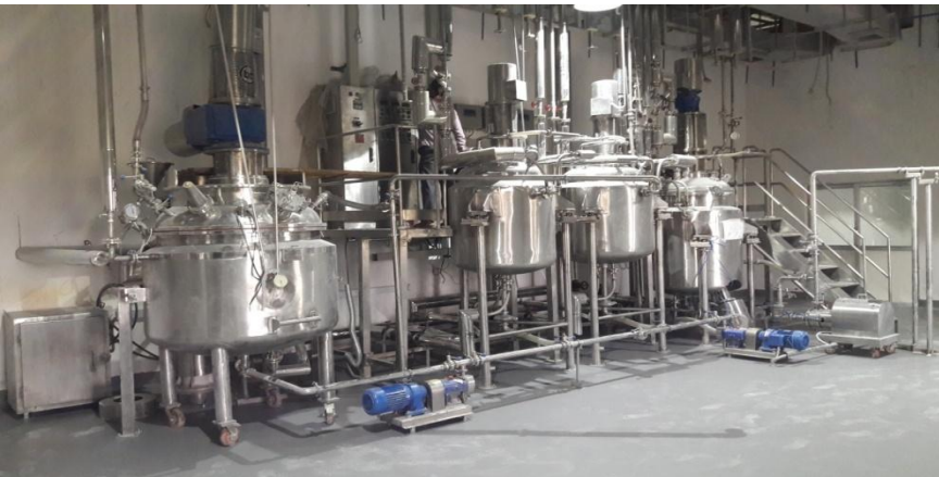
Ointment plant for 500 Litre capacity with Main mixer side pots and In tank homogenizer