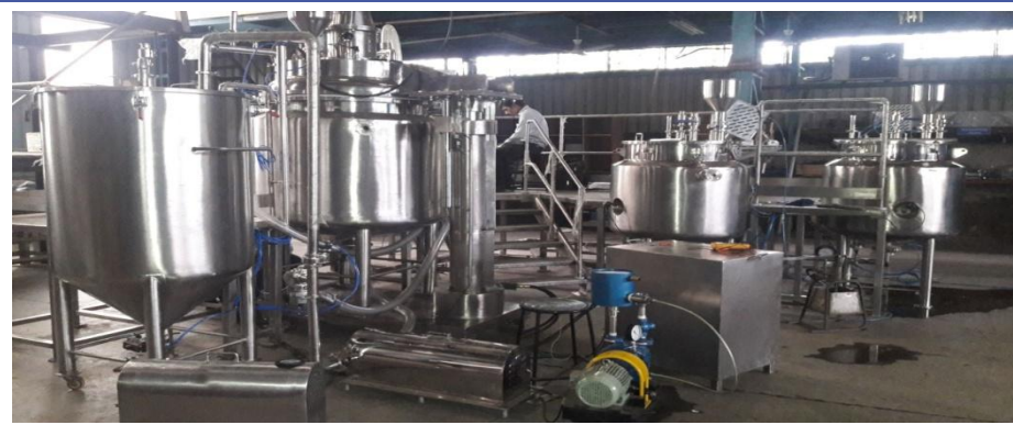
Hair cream plant for 1500 Ltr capacity