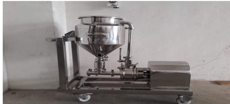
Inline Homogenizer with vessel