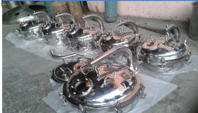
Manholes pressure and vacuum ratings with swivel arms